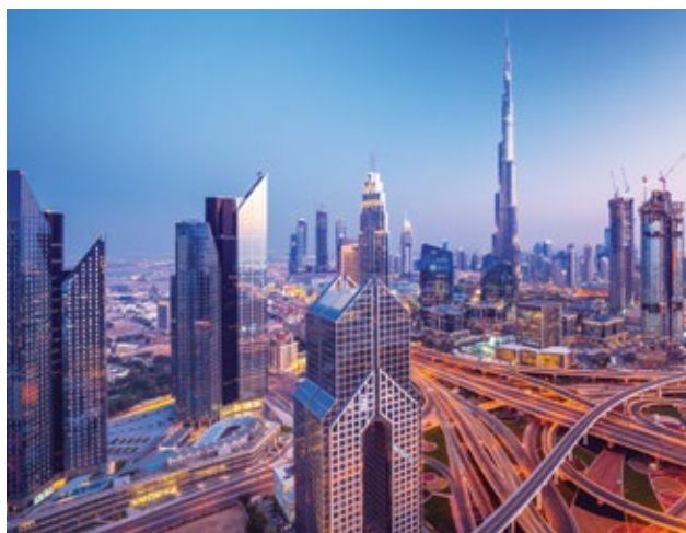
Dubai skyline at sunset, United Arab Emirates

4 nights Jordan: from $1,949 in double; $2,924 in single (includes intra-air from Amman, Jordan to Cairo, Egypt)