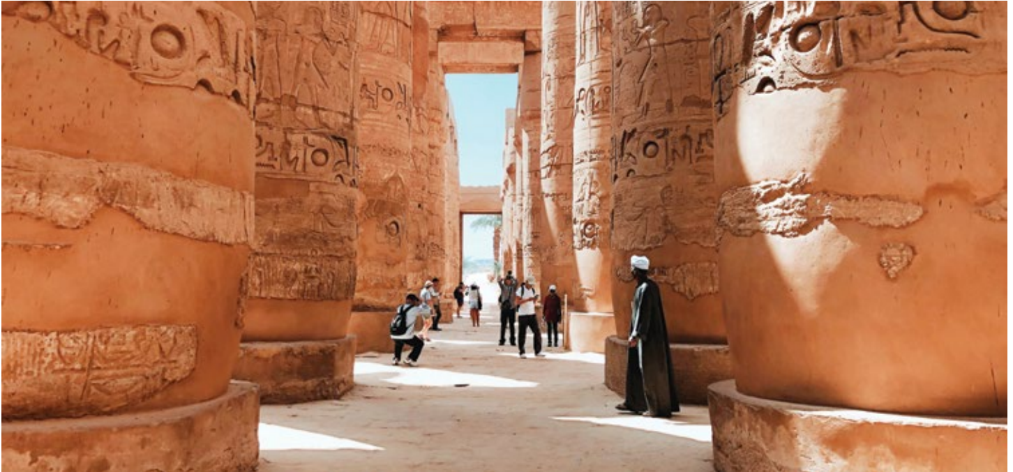
Karnak Temple at Luxor, Egypt

Reserve your Secrets of Egypt & the Nile river cruise and land adventure by June 30, 2020 and receive 5% savings on balconies and suites.