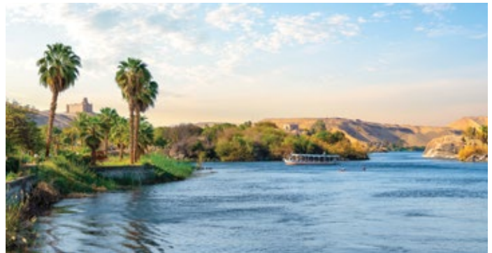
View of the Nile River in Aswan, Egypt