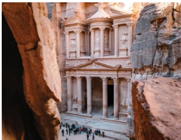
The Treasury in the ancient city of Petra, Jordan

Enhance your bucket-list cruise and land adventure and make the most of your time in this incredible region of the world before or after your 11-night Secrets of Egypt & the Nile itinerary by adding one or more of our exciting land programs below.