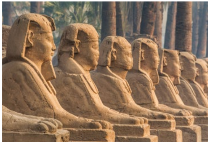
Avenue of the Sphinxes, Luxor Temple, Egypt

Contact your preferred Travel Advisor, call 1.800.626.0126 or visit AmaWaterways.com today