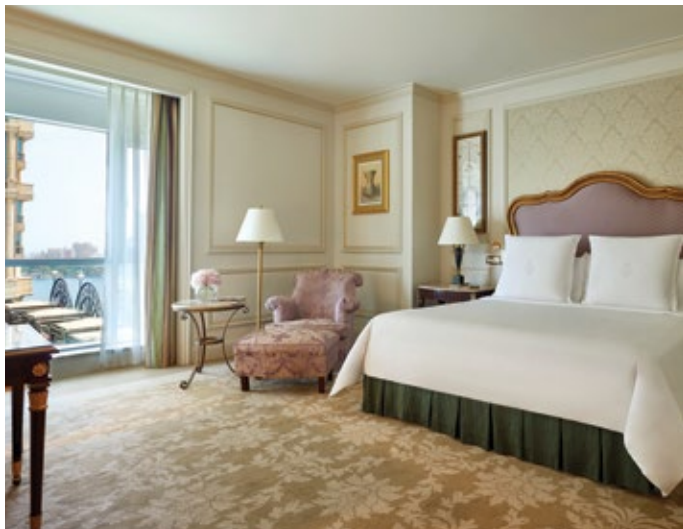
Four Seasons Cairo Superior Partial Nile-view Room

Flanked by botanical gardens and the western bank of the Nile River in Giza's prestigious First Place complex, you'll be in the center of it all. After exploring ancient wonders on your excursions, return to the hotel to relax by the pool or indulge in an aromatic massage once reserved for Egyptian royalty.