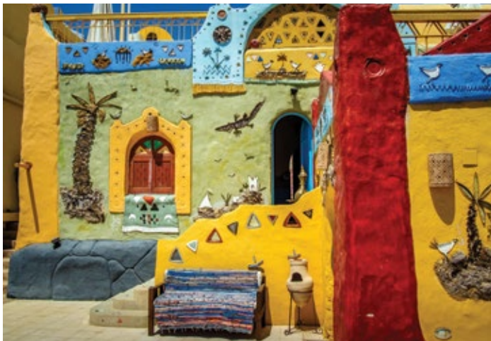
Nubian village, Aswan, Egypt