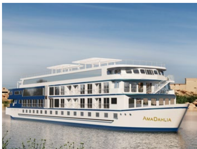
Stunning new AmaDahlia (rendering), Nile River

When it's time to embark for your Nile River cruise, you'll be warmly welcomed aboard a beautiful river cruise ship where luxury always means love with AmaWaterways. The stunning, newly designed AmaDahlia is an inviting 68-passenger ship offering 18 standard staterooms and 16 magnificent suites with amenities that will surprise and delight you, including a sun-deck swimming pool, The Chef's Table specialty restaurant, Wellness area with fitness room, nail and hair salon, and two massage rooms.