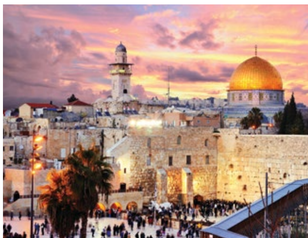
Old City at the Western Wall and Temple Mount in Jerusalem, Israel

3 nights Dubai: from $1,499 in double; $2,249 in single