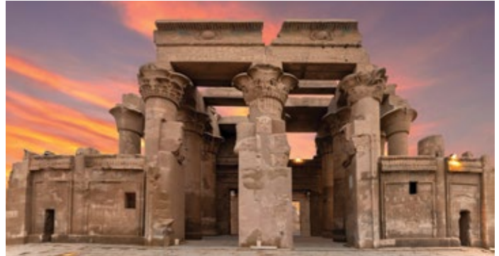
Temple of Kom Ombo, Kom Ombo, Egypt

During our 11-night Secrets of Egypt & the Nile itinerary, you'll enjoy three nights pre-cruise in Cairo at the 5-star Four Seasons Cairo at the First Residence, a 7-night Nile River cruise aboard the elegant AmaDahlia and one night post-cruise in Cairo, giving you the opportunity to explore sought-after sites by land and river. Discover ancient wonders such as the Great Hypostyle Hall of Karnak, the beguiling Temple of Luxor and the mystifying Valley of the Kings and Queens. Come face to face with King Tut's treasures as well as the Great Sphinx and the three Pyramids of Giza; and gain exclusive private access to the Tomb of Queen Nefertari and Cairo's Abdeen Presidential Palace. All of this and more is waiting for you in Egypt with AmaWaterways.