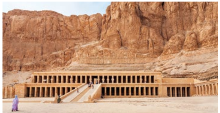
Temple of Hatshepsut at Luxor, Egypt