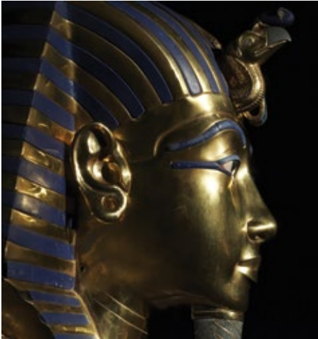
Egyptian Museum and King Tut Treasures, Cairo