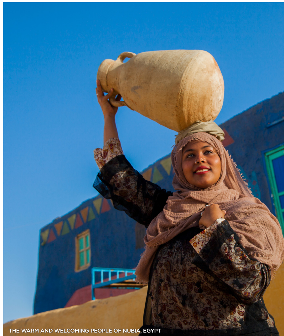
THE WARM AND WELCOMING PEOPLE OF NUBIA, EGYPT

When you reserve your flights with AmaWaterways, you not only receive included transfers to and from the airport to the ship or hotel and from the ship or hotel back to the airport, you will have peace of mind. AmaWaterways schedules flights on carriers who are approved by and members of the International Air Transportation Association (IATA), and we will coordinate the most direct route to your destination, so you'll arrive at convenient times.