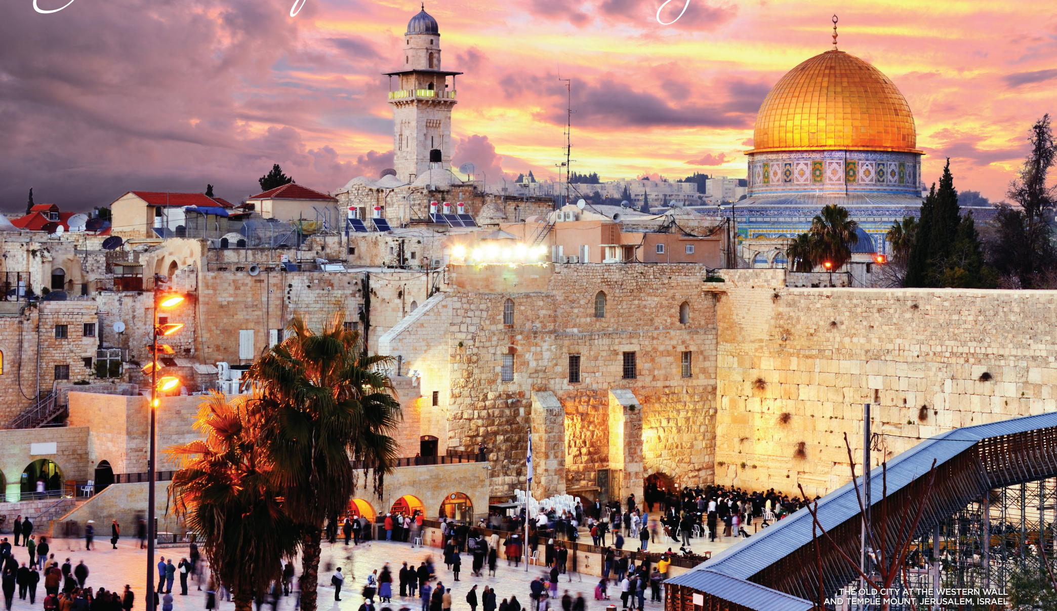
THE OLD CITY AT THE WESTERN WALL AND TEMPLE MOUNT, JERUSALEM, ISRAEL