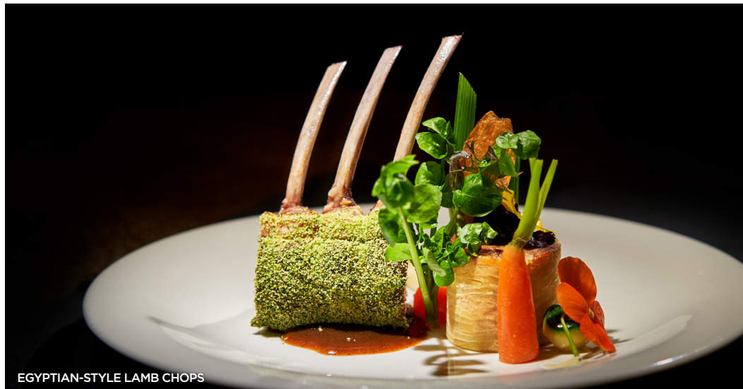
EGYPTIAN-STYLE LAMB CHOPS

While sailing, the ever-changing views of the Nile River provide the perfect backdrop as you prepare for daily adventures and recharge with bountiful breakfast and lunch buffets. During the evening, savor a multi-course menu in the Main Restaurant, or take a seat at AmaWaterways' The Chef's Table specialty restaurant, where you can watch as your chef prepares a true tasting menu with an appetizer, a champagne sorbet intermezzo, choice of main course and decadent desserts. Throughout your river cruise, enjoy unlimited complimentary wine, beer and soft drinks with lunch and dinner on board.