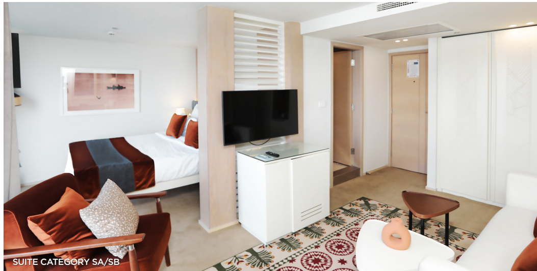
SUITE CATEGORY SA/SB