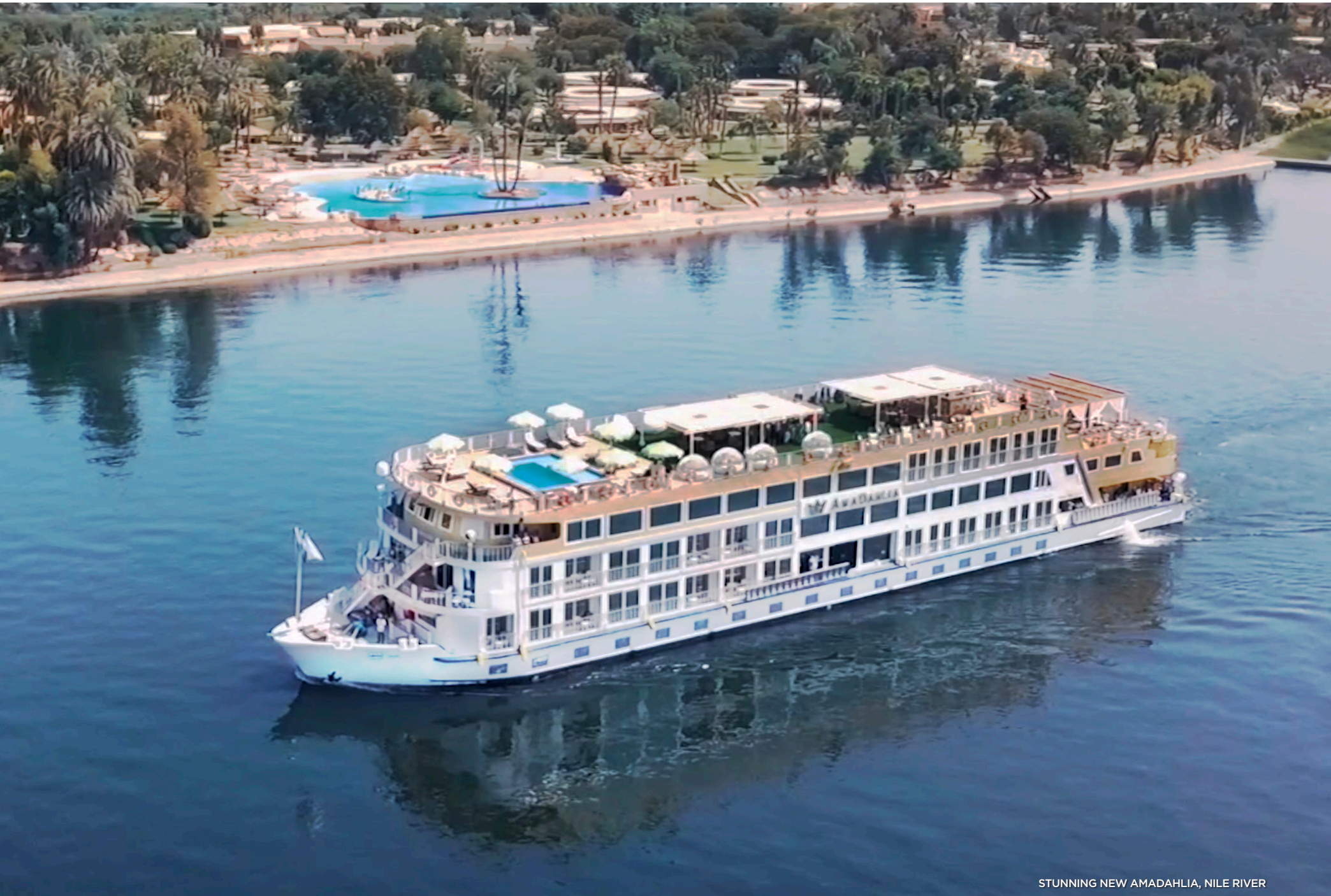
STUNNING NEW AMADAHLIA, NILE RIVER