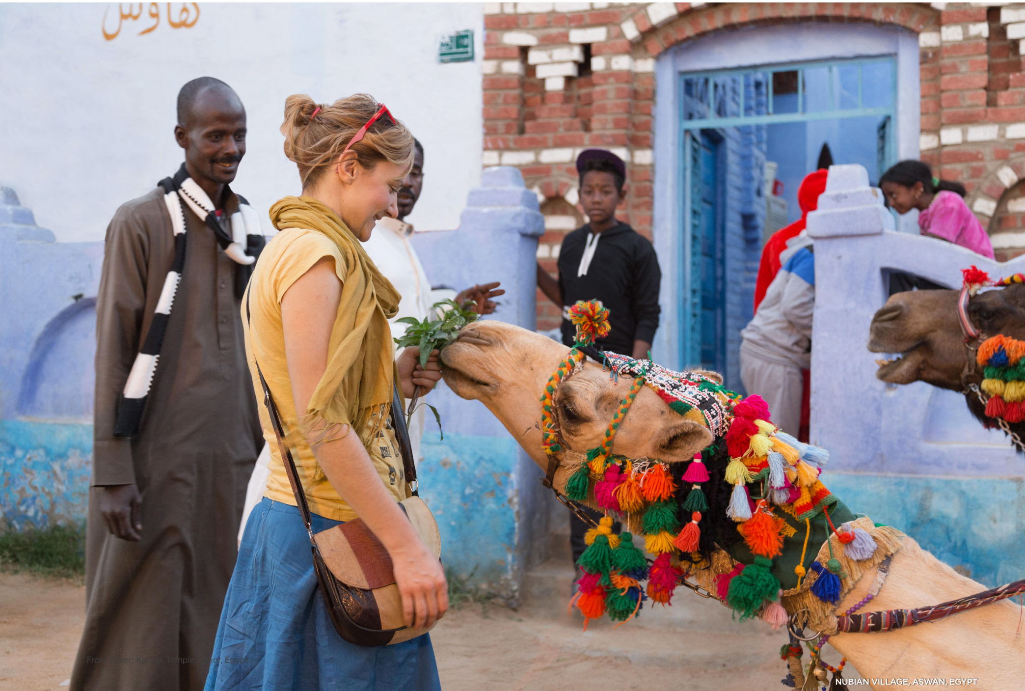
Front cover: Karnak Temple, Luxor, Egypt