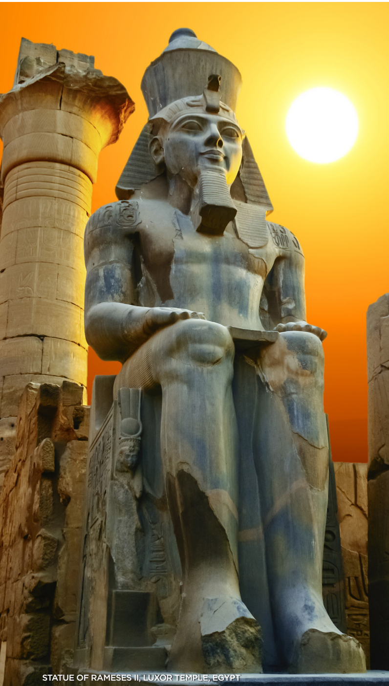
STATUE OF RAMESES II, LUXOR TEMPLE, EGYPT