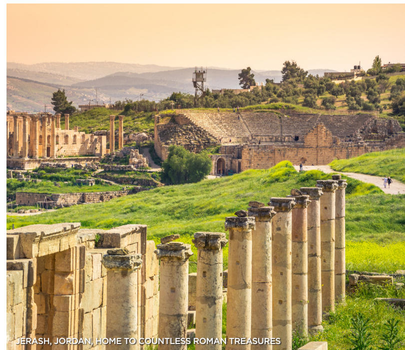
JERASH, JORDAN, HOME TO COUNTLESS ROMAN TREASURES

Note: Above pricing is additional, varies based on seasonality, and must be added to the Cruise & Land price. Depending on your citizenship, visas may be required for travel to Jordan; please consult with your Consulate for more information.