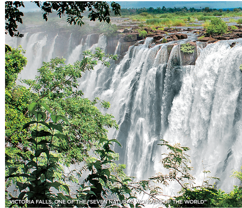
VICTORIA FALLS, ONE OF THE “SEVEN NATURAL WONDERS OF THE WORLD”

No matter which itinerary you choose, you’ll be treated to once-in-a-lifetime moments that will forever touch your heart and soul.