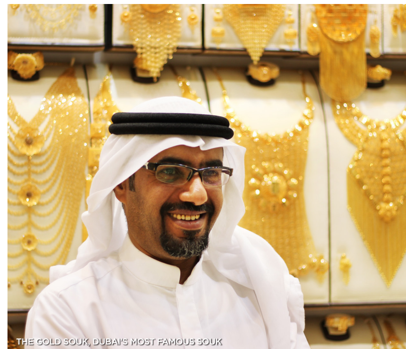
THE GOLD SOUK, DUBAI'S MOST FAMOUS SOUK

Note: Above pricing is additional, varies based on seasonality, and must be added to the Cruise & Land price. Airfare Dubai-Cairo is not included in price. Depending on your citizenship, visas maybe required for travel to Dubai; please consult with your Consulate for more information.