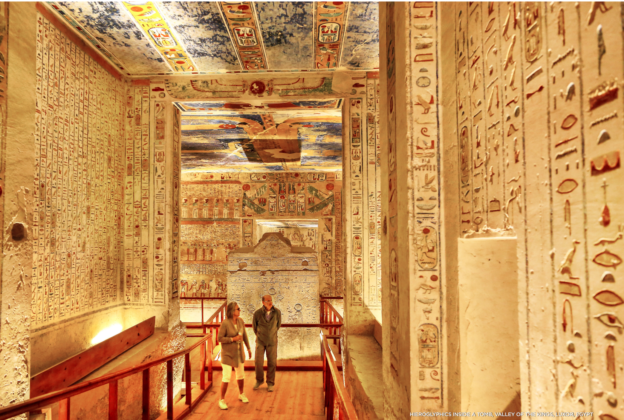
HIEROGLYPHS INSIDE A TOMB, VALLEY OF THE KINGS, LUXOR, EGYPT