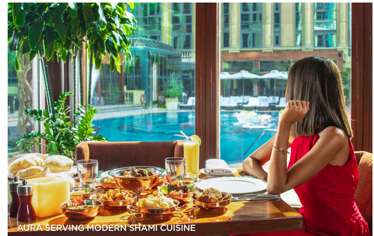
AURA SERVING MODERN SHAMI CUISINE