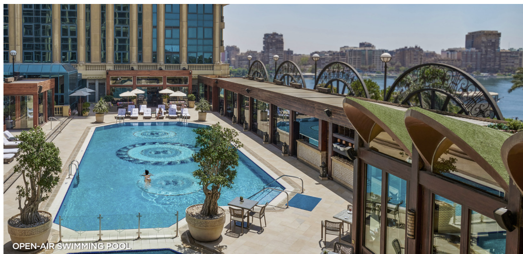
OPEN-AIR SWIMMING POOL