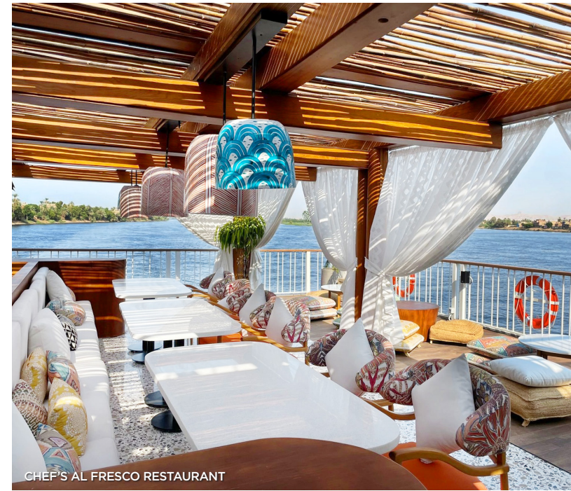
CHEF'S AL FRESCO RESTAURANT

A stylishly adorned main lounge with full-service bar and dance floor provides the perfect place to gather with fellow adventurers and companions. During the day, listen to insightful lectures, and at night, enjoy authentic local entertainment, including an Egyptian belly dance show, a Galabeya party and a Darawish show. The Sun Deck is the ideal setting to take in the views while indulging in a refreshing Egyptian beverage, karkade , ice-cold hibiscus tea or a glass of wine, while the pool invites you to take a dip. For those who wish to stay fit, you can work out in the well-equipped fitness room. Afterwards, soothe your muscles with a rejuvenating massage or treat yourself to hair and nail services at the salon.