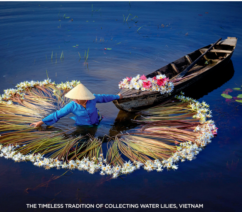
THE TIMELESS TRADITION OF COLLECTING WATER LILIES, VIETNAM