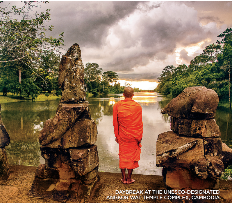
DAYBREAK AT THE UNESCO-DESIGNATED ANGKOR WAT TEMPLE COMPLEX, CAMBODIA