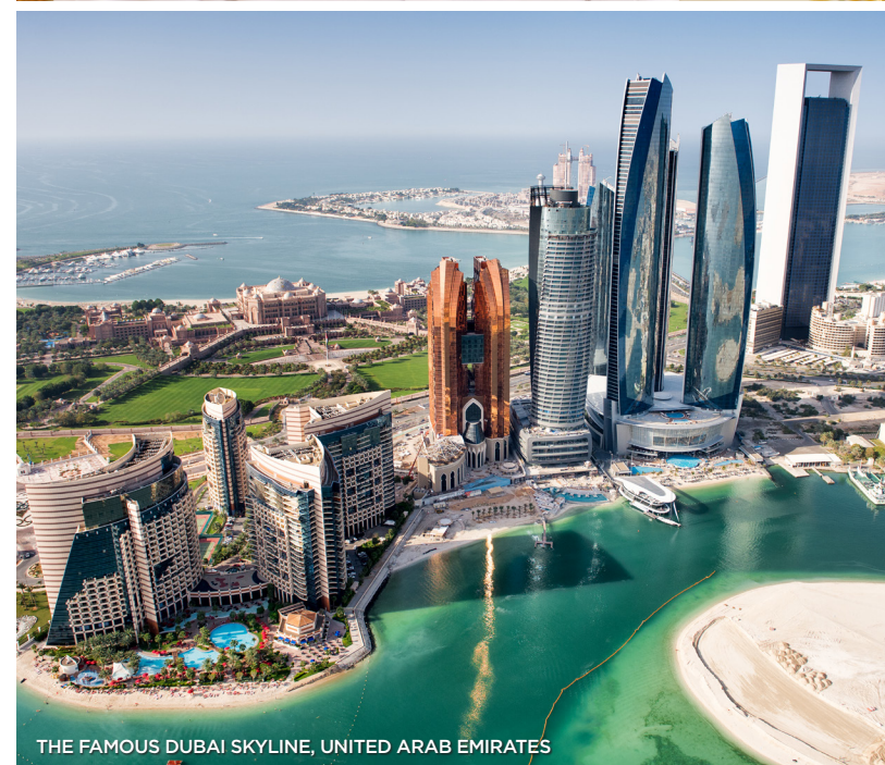
THE FAMOUS DUBAI SKYLINE, UNITED ARAB EMIRATES