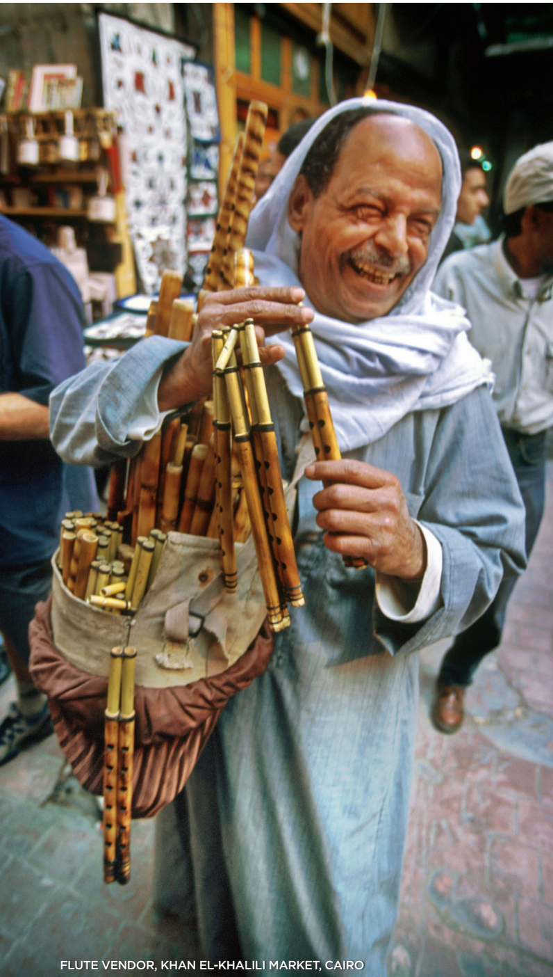
FLUTE VENDOR, KHAN EL-KHALILI MARKET, CAIRO