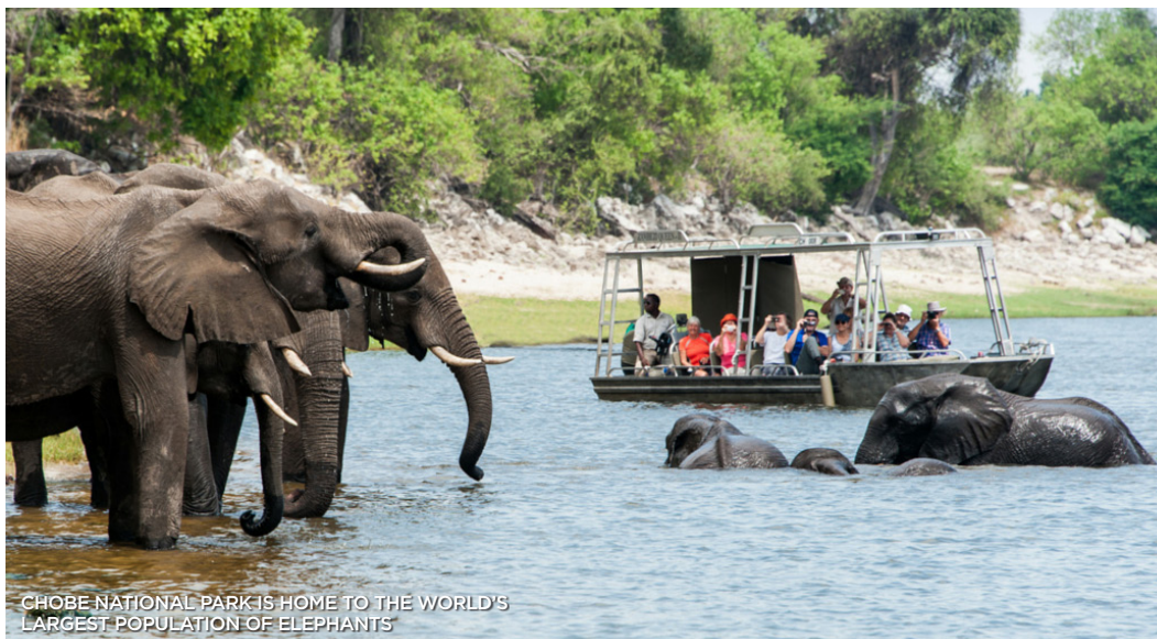
CHOBE NATIONAL PARK IS HOME TO THE WORLD'S LARGEST POPULATION OF ELEPHANTS