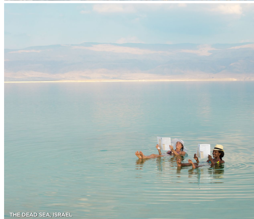
THE DEAD SEA, ISRAEL