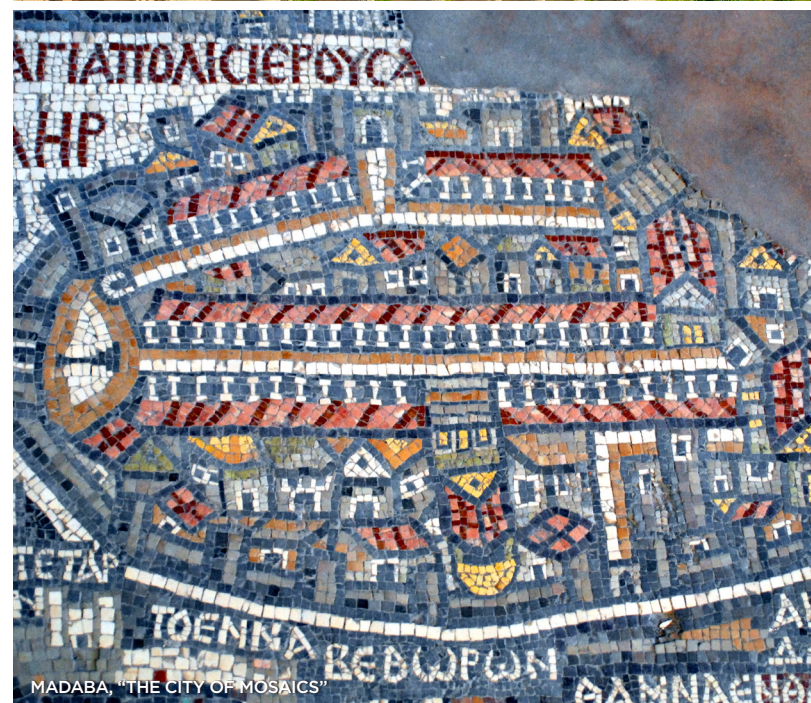
MADABA, “THE CITY OF MOSAICS”