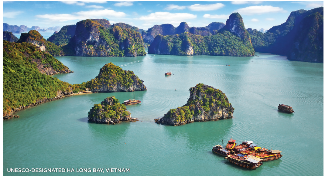
UNESCO-DESIGNATED HA LONG BAY, VIETNAM

Go off the beaten path to see small towns seemingly unchanged by time. While here, immerse yourself in the local culture and heritage of Vietnam and Cambodia. Authentic experiences allow you to witness the time-honored skills of local artisans creating exquisite handicrafts and delicacies using centuries-old traditions. From timeless villages to UNESCO-designated World Heritage Sites, such as Cambodia's Angkor Wat and Vietnam's Ha Long Bay, experience the best of these endlessly fascinating destinations.