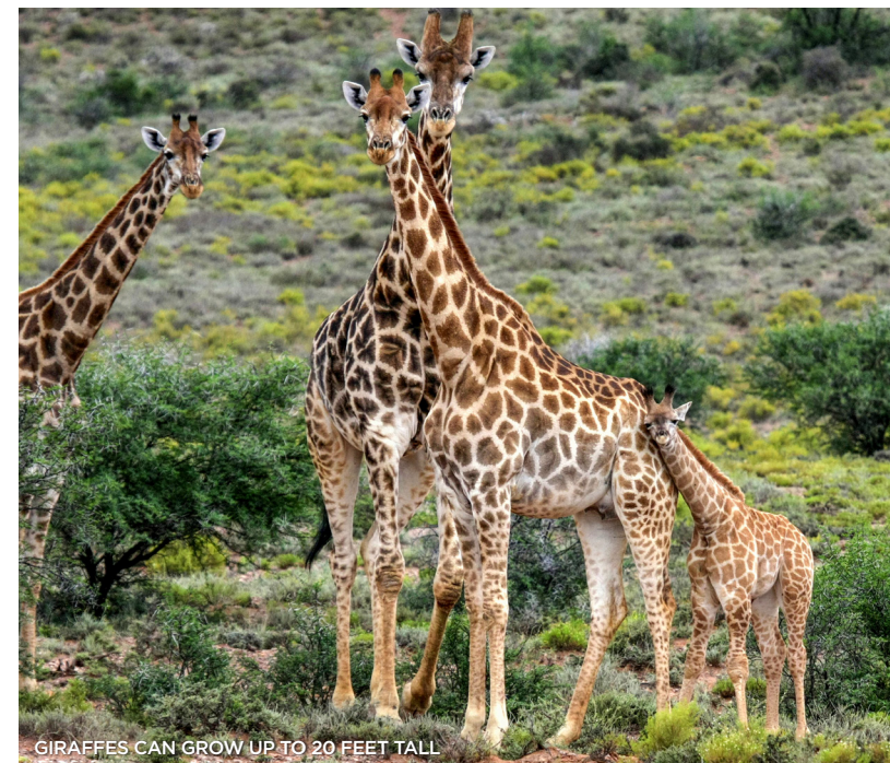
GIRAFFES CAN GROW UP TO 20 FEET TALL