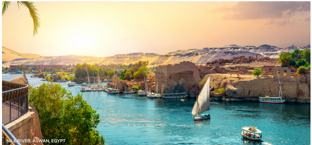
NILE RIVER, ASWAN, EGYPT

DAY 6, EDFU – ASWAN. Edfu is best known for one of Egypt's most remarkably preserved temples, dedicated to Horus, the falcon-headed god. After visiting Edfu, relax on board as the ship continues onward to Aswan. (B, L, D)