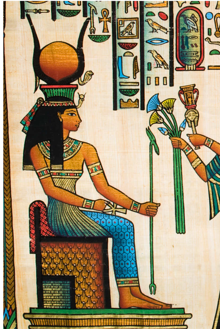
Front cover: Sunset Felucca Ride, Nile River, Aswan, Egypt