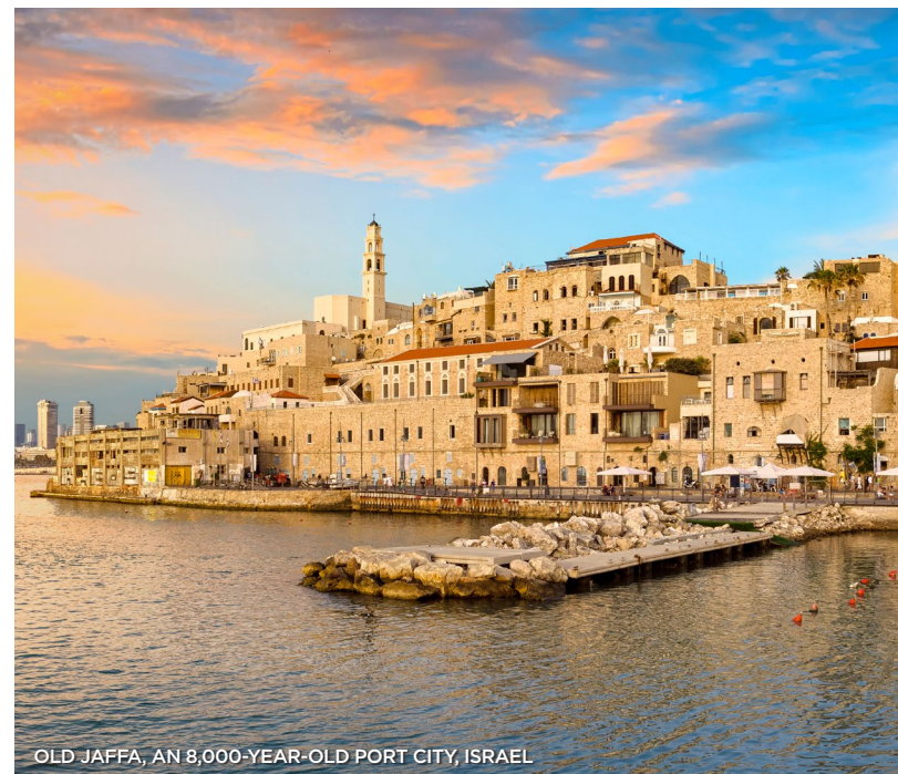
OLD JAFFA, AN 8,000-YEAR-OLD PORT CITY, ISRAEL

Note: Above pricing is additional, varies based on seasonality, and must be added to the Cruise & Land price. Depending on your citizenship, visas may be required for travel to Israel; please consult with your Consulate for more information.