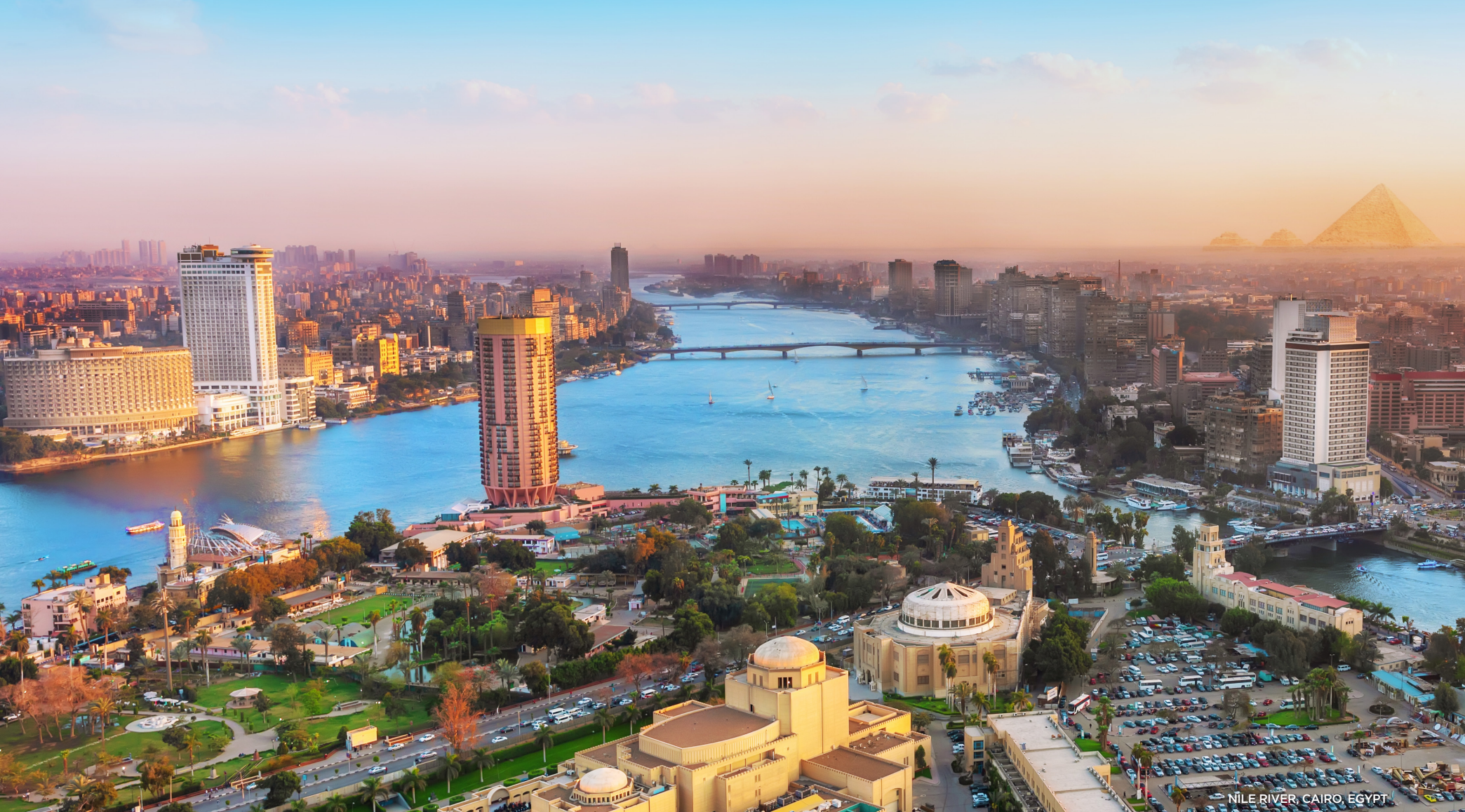
NILE RIVER, CAIRO, EGYPT