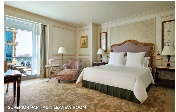
SUPERIOR PARTIAL NILE-VIEW ROOM

Seasons, an elegant restaurant overlooking the Nile River, serves delectable fare, including an Italian-inspired chef's menu. Lai provides authentic Thai cuisine; the poolside restaurant, Aura, offers modern Shami cuisine; and La Gourmandise Brasserie features contemporary French cuisine. For the ultimate experiential highlight, enjoy afternoon tea underneath the astonishing Great Ocular in the Tea Room, where the talented pastry team serves up an unexpected regional twist on a traditional afternoon tea.