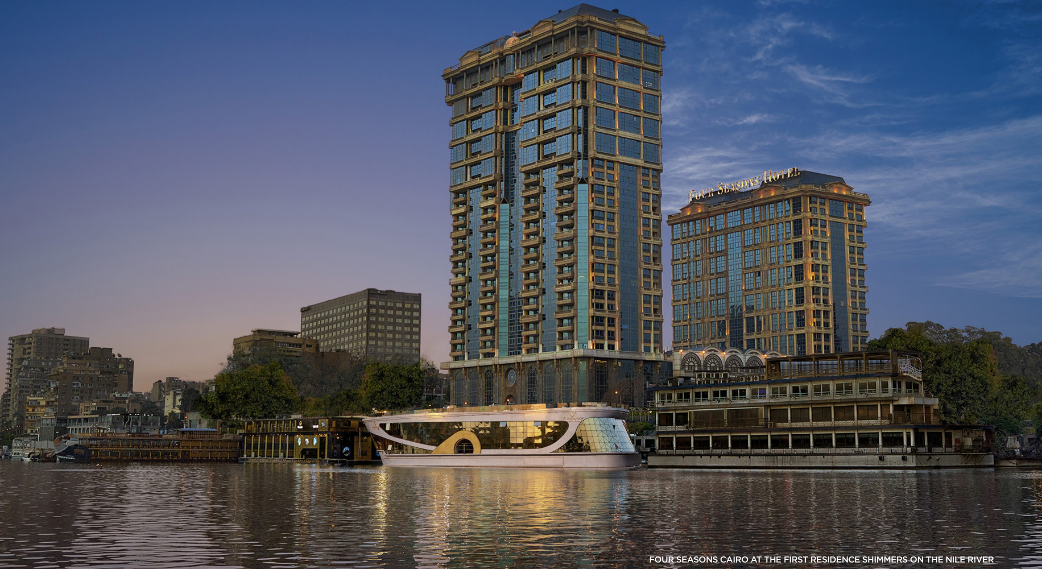
FOUR SEASONS CAIRO AT THE FIRST RESIDENCE SHIMMERS ON THE NILE RIVER