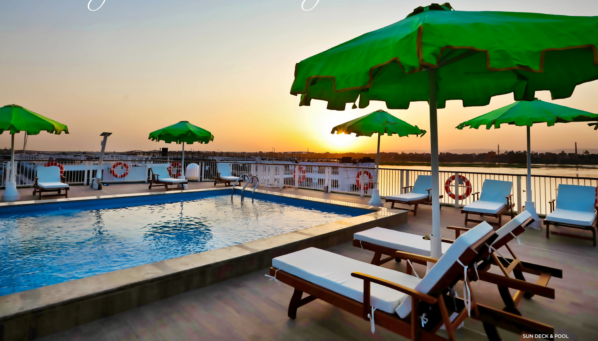
SUN DECK & POOL