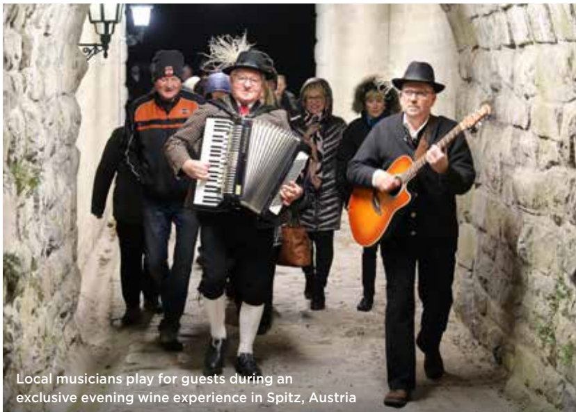
Local musicians play for guests during an exclusive evening wine experience in Spitz, Austria