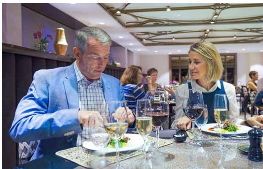
Left: Biking along the Danube. Top: Sightseeing in Bratislava, Slovakia. Above: Dining at The Chef's Table.