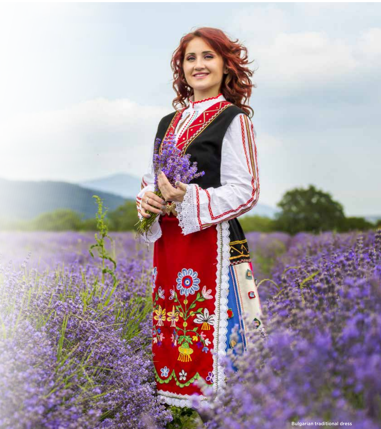
Bulgarian traditional dress