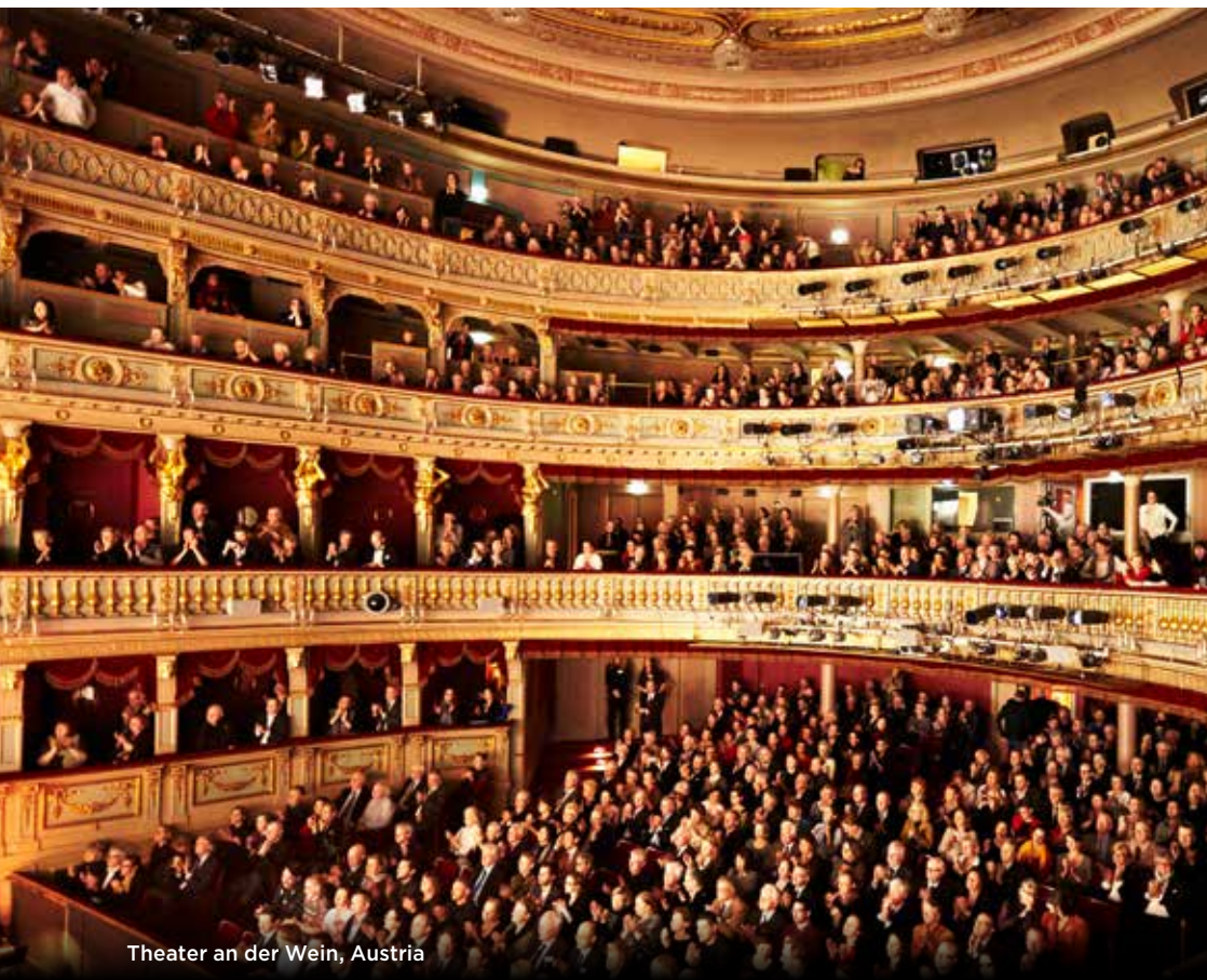
Theater an der Wein, Austria