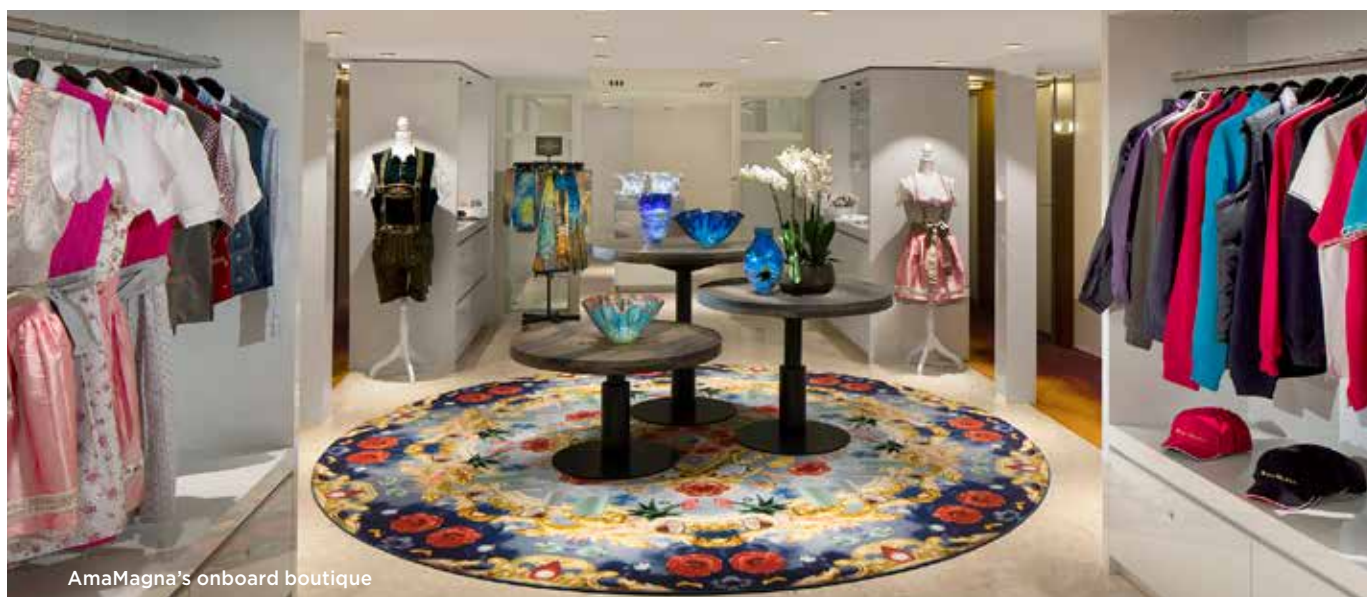
AmaMagna's onboard boutique