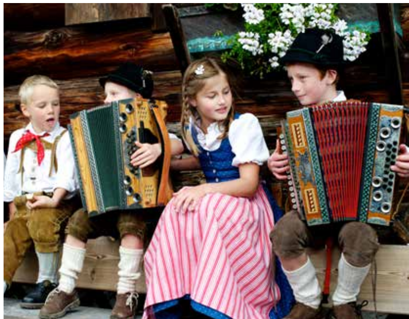
Insets: Romanian blouse (top), loden coat (bottom). Above: Traditional Bavarian clothing.