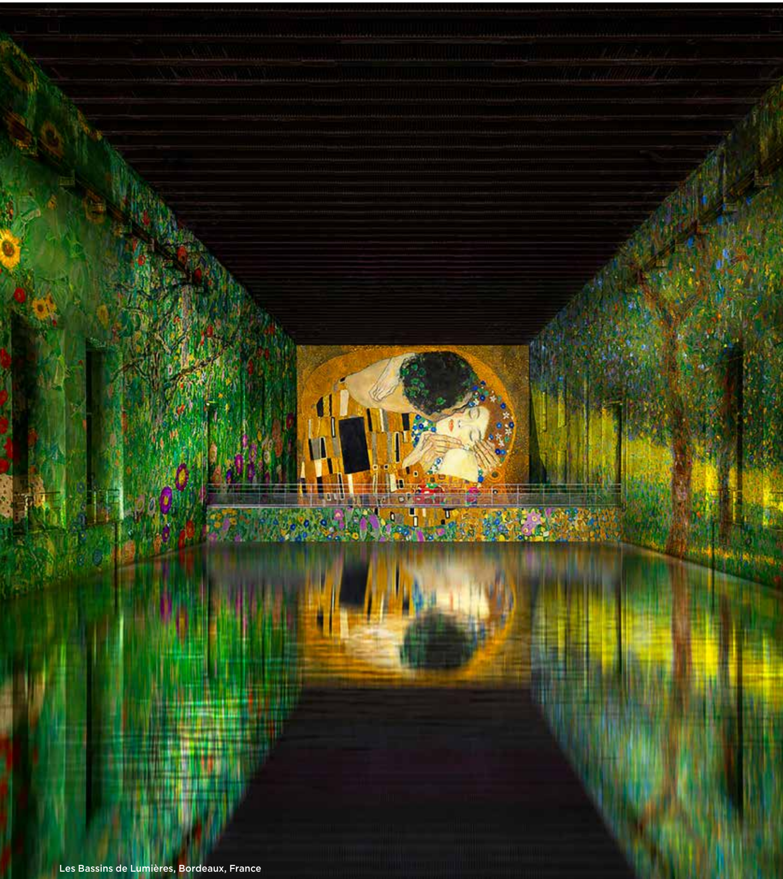
Les Bassins de Lumières, Bordeaux, France