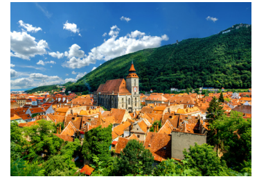
Black Cathedral, Braşov, Romania