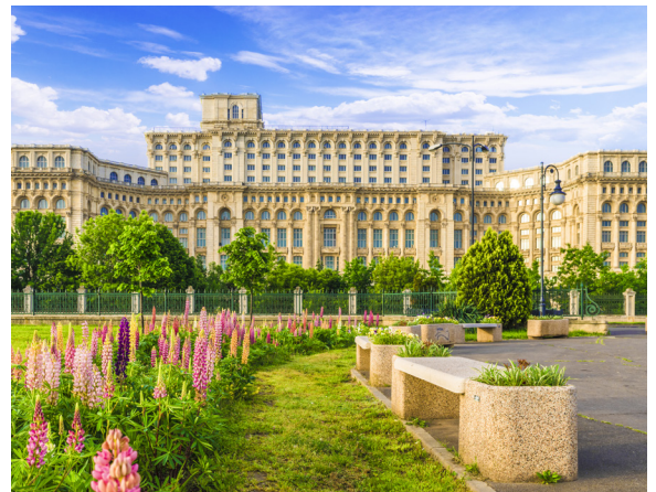
Palace of the Parliament, Bucharest, Romania