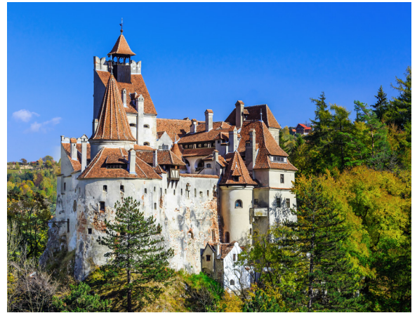
Bran Castle, Bran, Romania