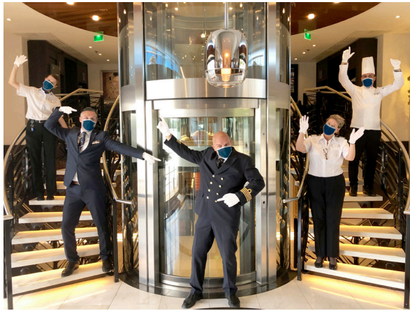
Warm-hearted crew who make your safety a top priority