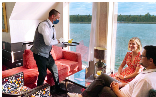
Enhanced safety measures and unparalleled service

Certain long distance transfers not included