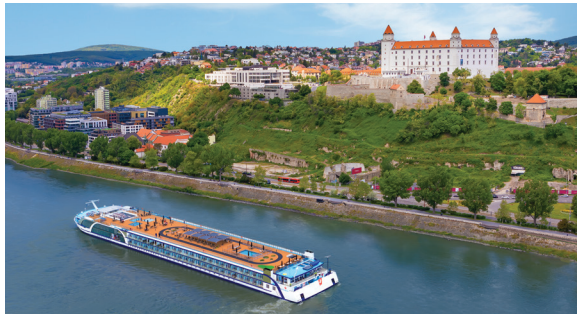
AmaMagna in Bratislava