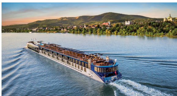
AmaViola sailing on the Danube River