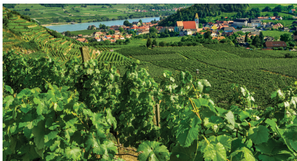
Vineyards in Austria's Wachau Valley