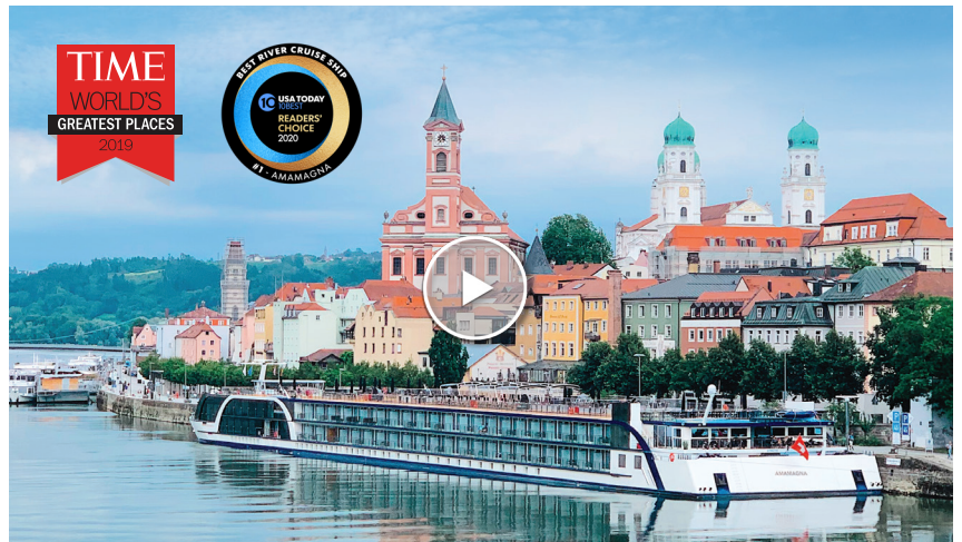
AmaMagna in Passau, Germany