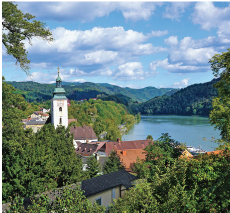
Be treated to a private castle visit and reception in Grein, Austria.