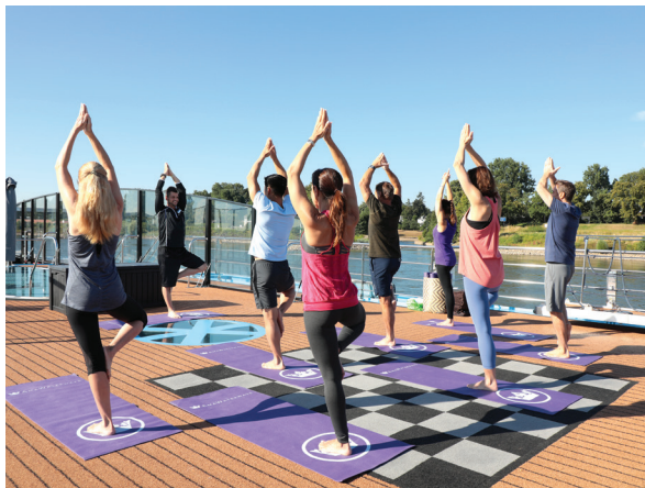
Enhance your best self