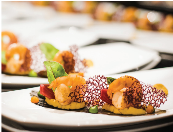
Exquisite locally-sourced cuisine