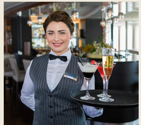
Our crew always goes above and beyond