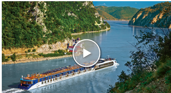
Cruising through the Iron Gates