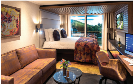
AmaMagna Balcony Suite

With fewer guests on board, you can enjoy the luxury of space to unwind, relax and reconnect with your loved ones. Our public areas, including lounges and restaurants, are never crowded.