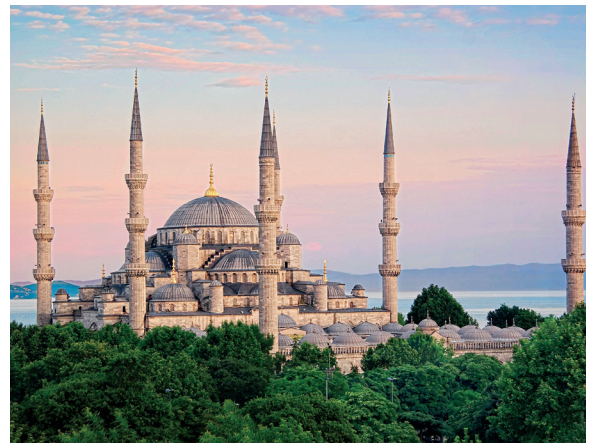
Blue Mosque, Istanbul, Turkey