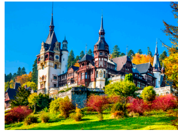
Peleş Castle, Sinaia, Romania

Cruise through the Danube River's iconic Iron Gates. Enjoy the blending of nature, art and architecture at sites such as Bulgaria's Belogradchik Rocks and the Rock-Hewn Churches of Ivanovo. Expand your world and your palate in a region rich in culture, with distinctive gastronomy including banitsa pastries, Szekszard wine and Serbian plum brandy. Plus, connect with knowledgeable Cruise Managers and crew who often hail from the countries we visit and can offer you unique expertise on the region's history as well as local hotspots.