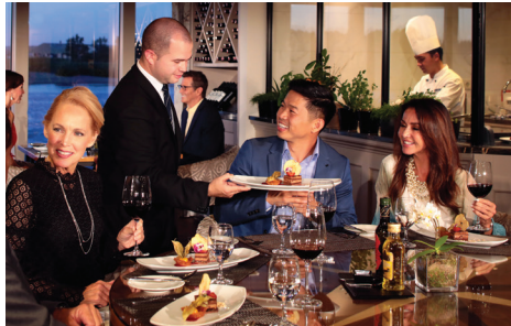
Delicious Cuisine at The Chef's Table