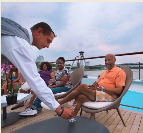
Unparalleled personalized service