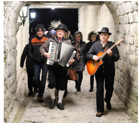
Enjoy an evening sampling famous regional wines in Spitz, Austria.