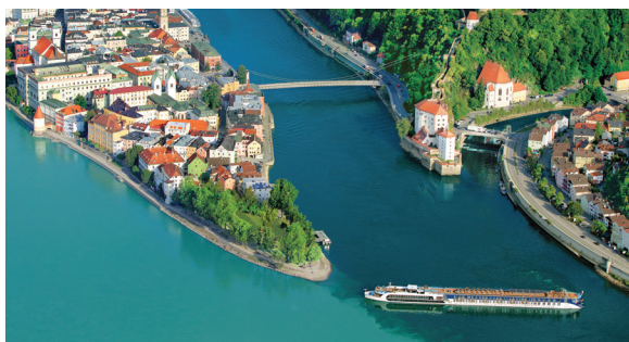
AmaPrima sailing through Passau, Germany

Regensburg, Germany is a wonderfully preserved medieval city in which you'll sample three of its most renowned delicacies: savory bratwurst, German spice beer and a fresh-baked pretzel.