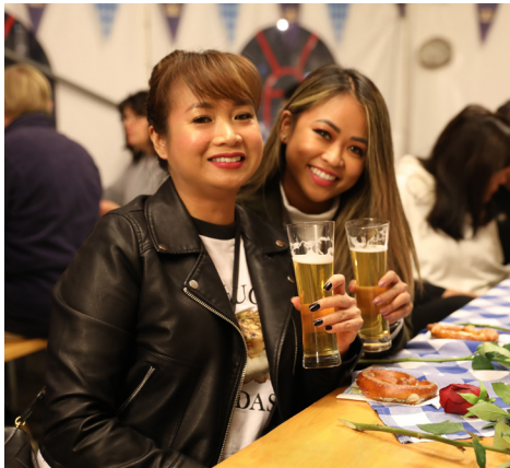
Celebrate Oktoberfest year-round at this special event held in Vilshofen, Germany.

AmaWaterways has forged strong relationships with local officials in off-the-beaten-path destinations, giving our guests exclusive access to intimate, authentic experiences ashore.