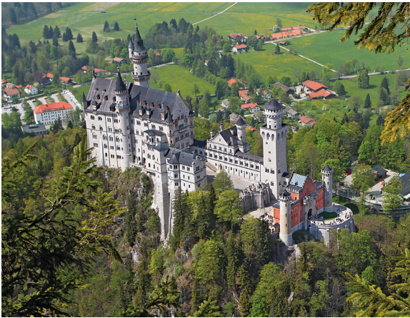
Neuschwanstein Castle, Munich, Germany

Available on: Magna on the Danube , Melodies of the Danube and Blue Danube Discovery