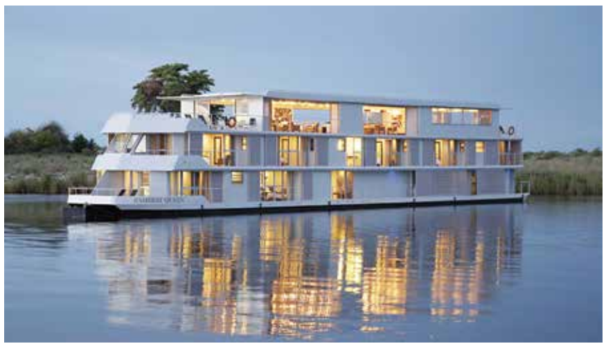
Zambezi Queen on the Chobe