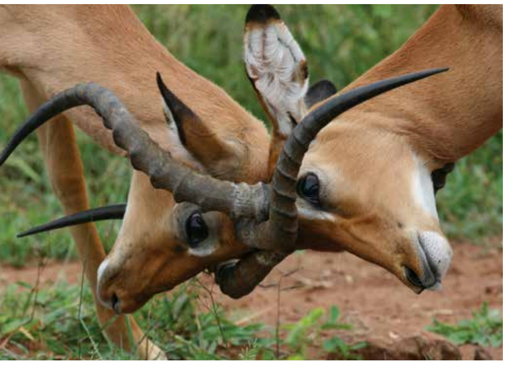
A playful day in the bush