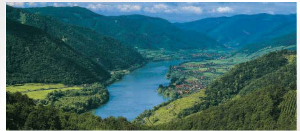
Wachau Valley, Austria

Day 12, BAMBERG. Enjoy your breakfast as you cruise along and marvel at the engineering feat of the Main-Danube Canal which straddles the Franconian Alps via 16 locks. Then arrive in Bamberg and enjoy a walking tour of this medieval gem, which