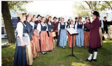
Folklore entertainers, Wachau Valley

Combine the highlights of the legendary Main and Danube with the picturesque Rhine and Mosel and experience a voyage of cultural and scenic diversity through the six countries of Hungary, Slovakia, Austria, Germany, Luxembourg and France. Start your European vacation with two grand old capitals, vibrant Budapest and magnificent Vienna. Journey on the Main-Danube Canal across the Continental Divide, and visit charming towns with beautiful vistas. Cruise through the lush and scenic Mosel Valley, famous for its many historical castles and the steepest vineyards in the world, and be close to the heart of the people living in the medieval cities along the Rhine and Main river. Conclude your European vacation in Paris, the City of Lights.