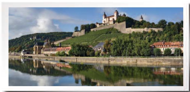
Marienberg Fortress, Würzburg