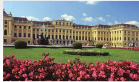
Schönbrunn Palace, Vienna